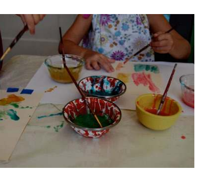
This experience of lack of available childcare is consistent in Lake Babine communities: there are no child care facilities in Fort Babine, the community that would be closest to one of the PRGT construction camps.

Calls are being made for daycare facilities in remote communities, and programming for youth. Programming for youth could involve language and cultural education programming, highlighting that when parents are away working at industrial camps, they take the local Indigenous language with them, decreasing children's exposure to their native language and culture. As one community health worker noted: