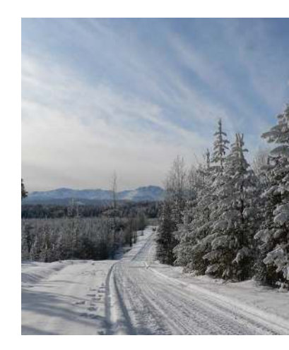
Transportation associated with project development can further aggravate local infrastructure, such as roads, and can increase risks for workers and locals.

Safety rules are fine, but you feel like you're under a thumb of safety — if you do not abide completely, you could lose your job. 'Blowing off steam' is about experiencing freedom from very restrictive safety regulations. Suddenly, you can do whatever you want without fear of losing your livelihood. For example, on