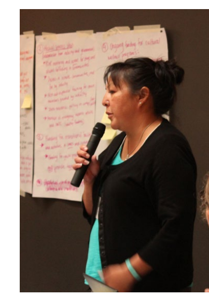
The values that are set at an industrial camp can influence how women are treated at the site, and interactions in the area.

The values that are set at an industrial camp can influence how women are treated at the site, and interactions in the area. This report referred to the values and worldview associated with 'Rigger Culture', which tend to promote sexist and even misogynistic views of women. Sometimes racist or ill-informed views are held towards Indigenous people. This can only be changed through policies, programs, and in depth relationships with local peoples.